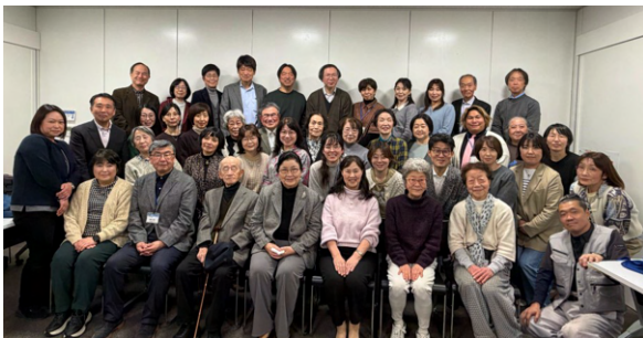
Ready for next year! All energized after an evening of connection, bento and Bingo.