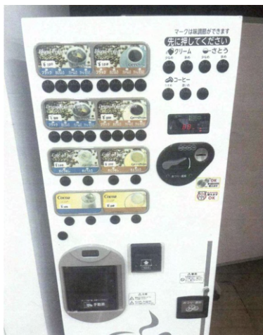
Cat café vending machine with all free drinks!

In line with “Japan’s massive vending machine culture,” Grace once counted 16 on the street in a very short time while on a bus in downtown Kashiwa. She was eager to try a variety of drinks and get a different one each day. What surprised her was the absence of the soda ramune which she had in America, but found in Japan is only for special occasions or festivals. Here are places she used vending machines -