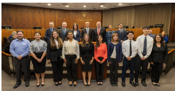
Torrance City Council, TSCA President, and 2026 Delegation