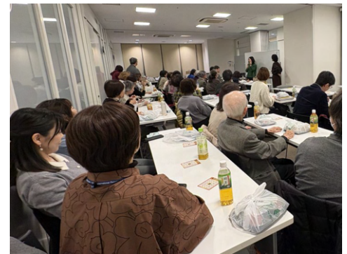
Bingo begins. Waiting for the numbers to be called.

It was a wonderful way to refresh ourselves, and we are now fully energized and ready for another fantastic year of activities ahead!