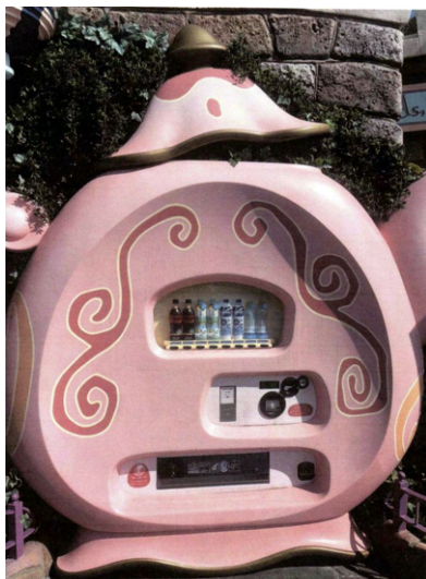
Teapot vending machine at Tokyo Disney

pottage and strawberry au lait, which she chose and which reminded her of American strawberry milk.