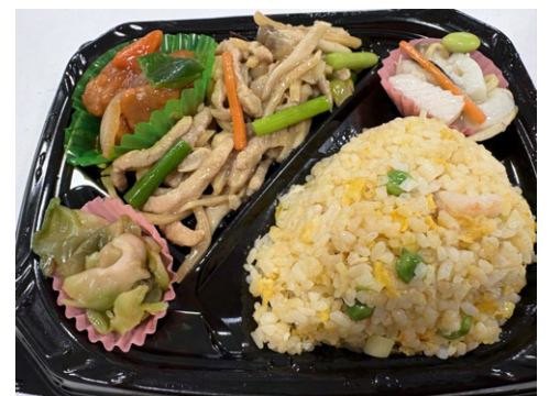
A close-up of the gourmet bento that made the evening extra special.