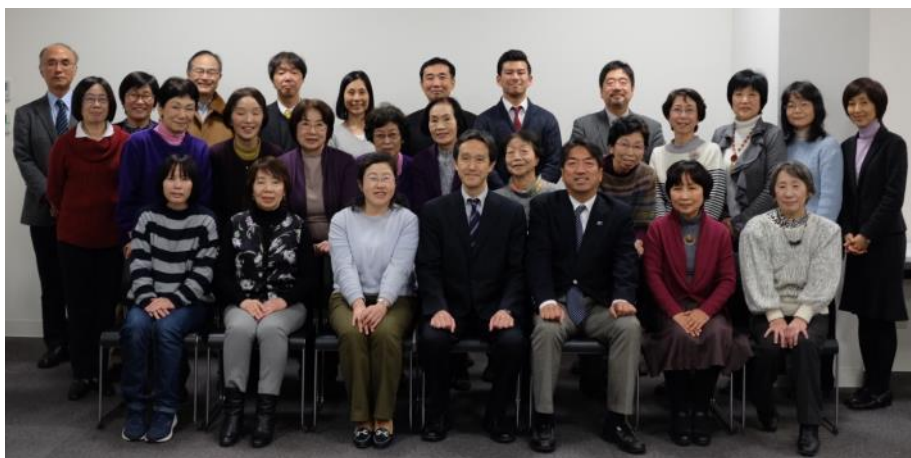
All attendees of the KIRA New Year's Party